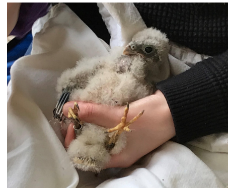
Young kestrel which has just been ringed

Barn owls are a Schedule 1 species under the Wildlife and Countryside Act 1981 and boxes should not be checked during the breeding season except by a person holding a permit to do so.