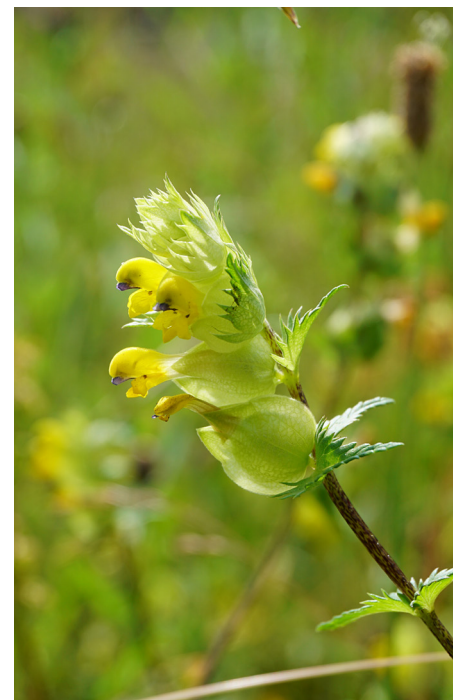
Yellow rattle at Poppy Knapp Lower Pertwood