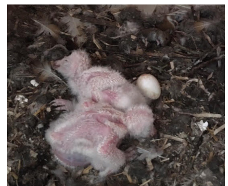
Two very young barn owlets with an egg due to hatch