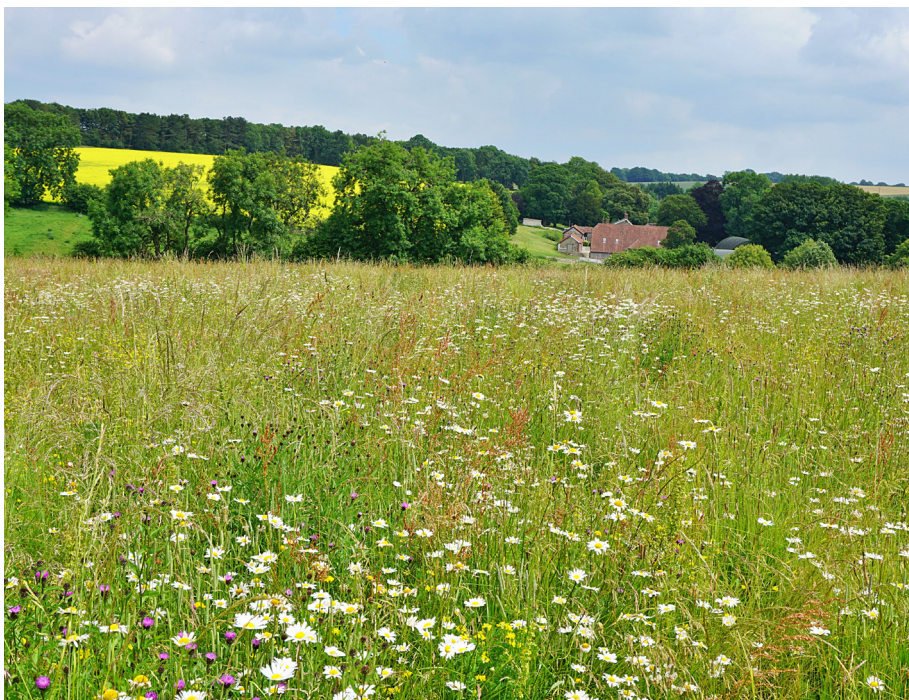
View of Lower Pertwood Farm from Poppy Knapp wildflower meadow by Patrick Cashman

In the same autumn as harvesting, the seeds were sown directly onto the surface of tilled soil at Poppy Knapp by volunteers Stuart Corbett and Nick Adams before being rolled in. Autumn sowing mimics nature's timing and ensures the greatest seed viability for the range of native wildflowers, which need to be near the surface to germinate and pressed in by a roll to provide good contact with