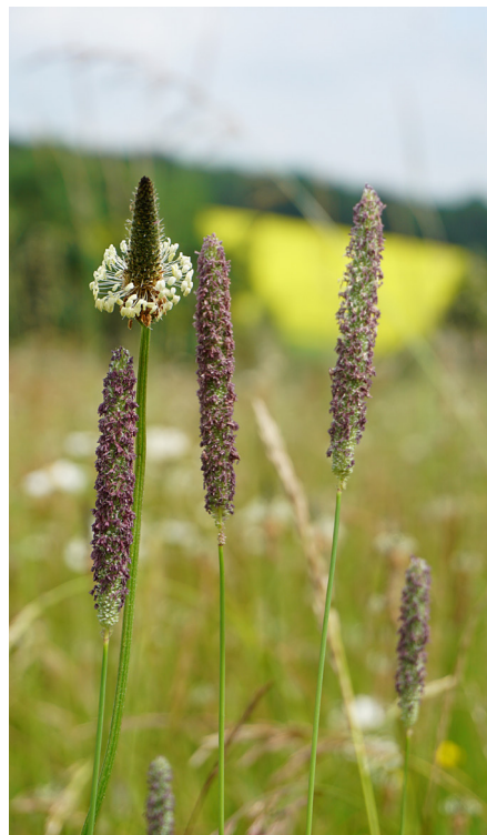
Timothy grass and plantain flowers