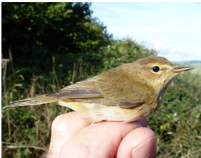
Willow Warbler, a sub Saharan migrant

May we take this opportunity to offer our thanks to the owner and staff at Lower Pertwood who have made all our work possible.