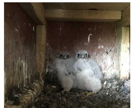
Two young kestrels which were ringed on 19 June 2021