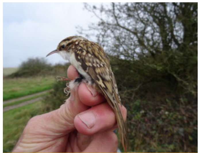
Tree Creeper, a resident breeding bird. Both species breed in Peewits Gorse